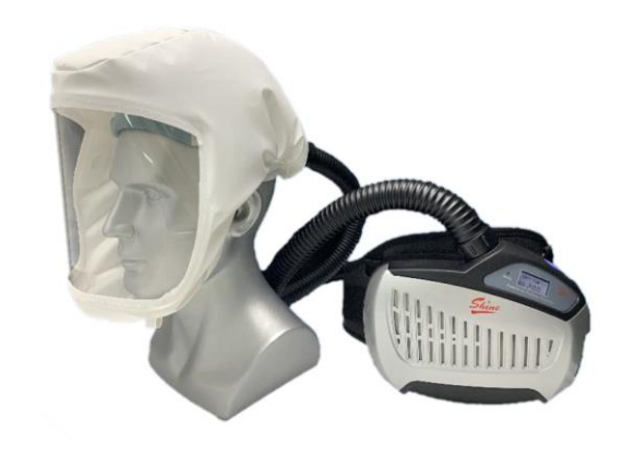
PAPR HE Filter TH3P R SL